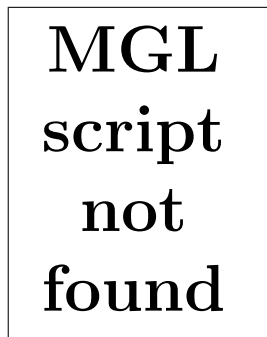
Figure 2: This box is shown by mg \text{\LaTeX} instead of a script that should be included, but can't be found.