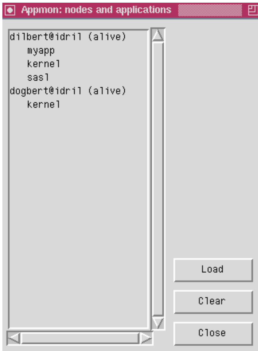
Figure 1.3: The Listbox Window.