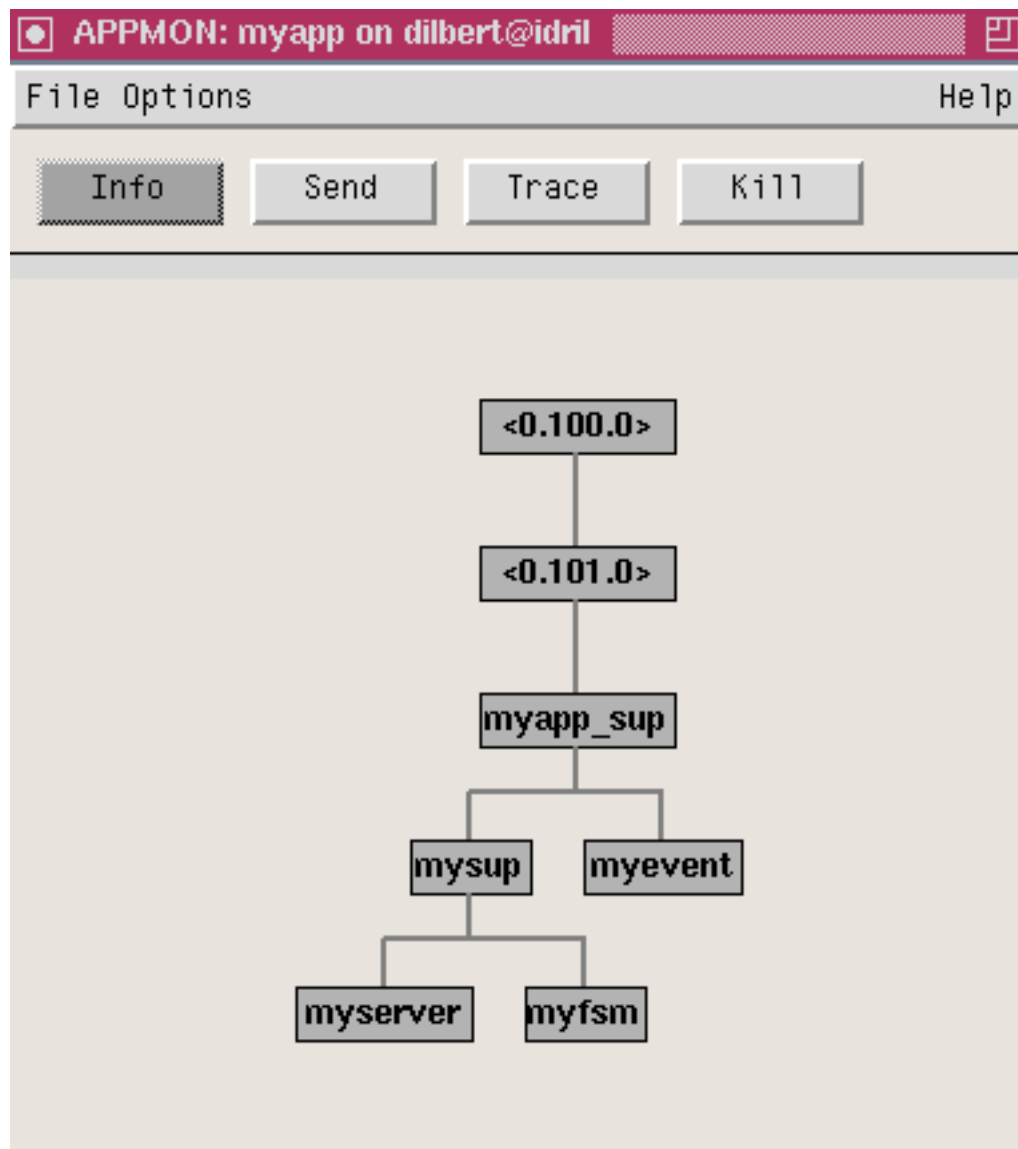
Figure 1.2: The Application Window.

The application can be shown either as a strict supervision tree, or as a process view with all linked processes. In supervision mode, the tree-gathering and -building algorithm assumes conformance to the OTP design principles.